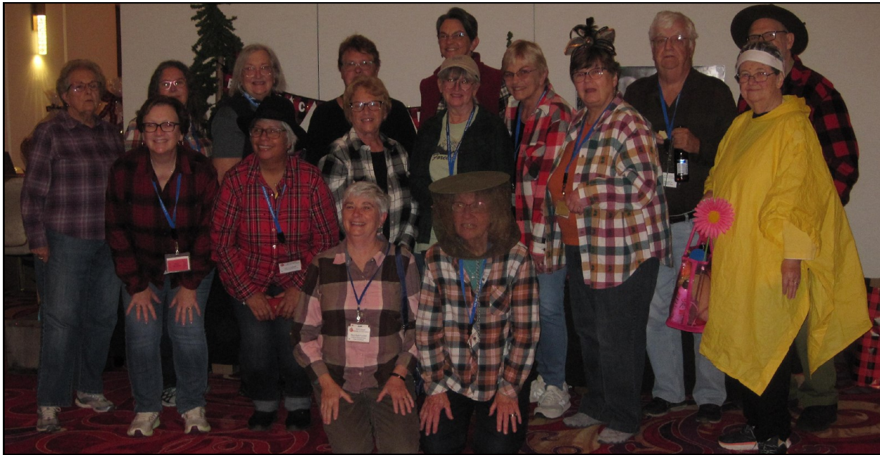
CWZ Delegation dressed for the Black Fly Ball