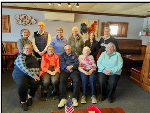
Southern Zone Board of Directors: