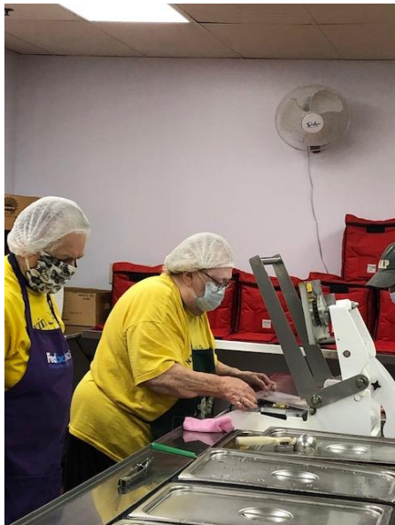
Twin City Volunteer sealing a meal in microwave container