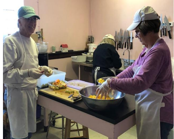
South Buffalo Volunteers preparing fresh fruit cups