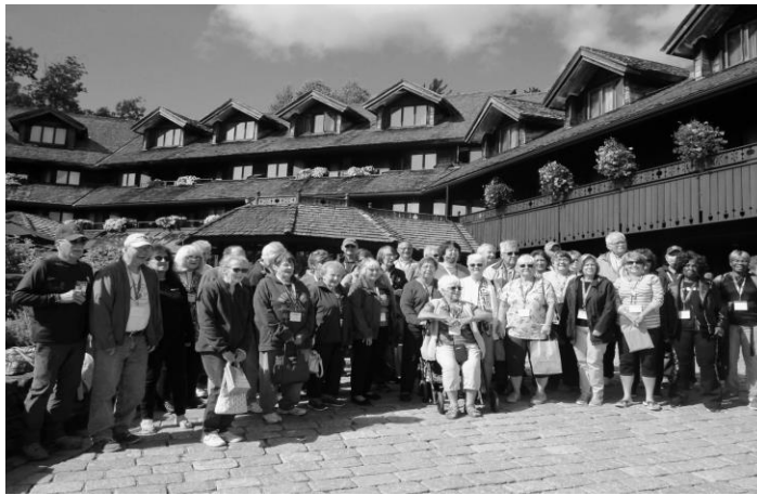
WZ members enjoying the VT and NH trip

Additionally, save the dates of September 25-30, 2022 for a trip to Tennessee’s Smoky Mountains . Details and reservations will be in the next issue of WESTERN CURRENTS.