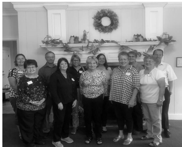
New ENCRTA members at the fall meeting