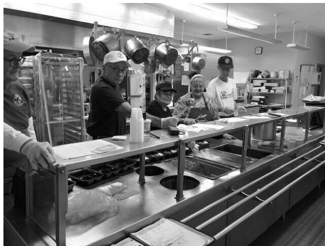
Kitchen Volunteers at Ken-Ton Meals on Wheels