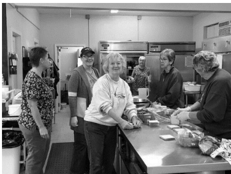
Alden Meals on Wheels Volunteers