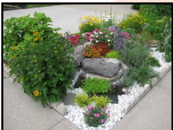
Bushnell's Gardens; Adams, NY

Executive Council Meeting, November 6, 2019, Watertown BOCES, Admin. Building, Conf. Rm. C