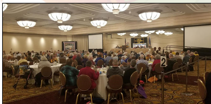
We had a great turnout for the convention