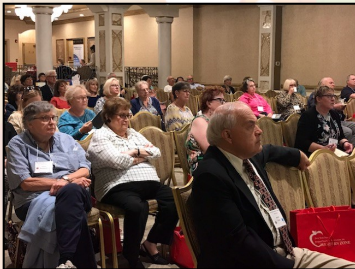
WZ group listens to medical doctors presentation at the annual conference