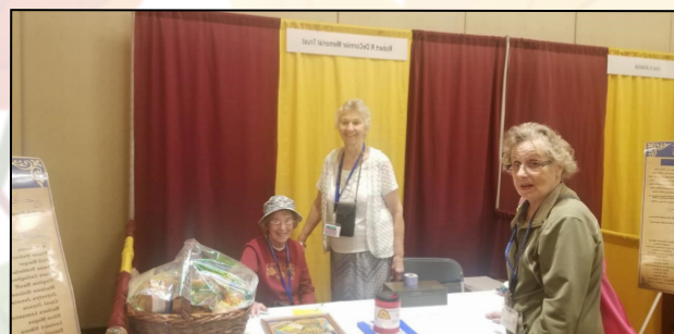
DeCormier Trust booth