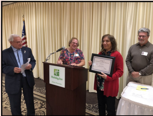
Southern Zone Special Recognition

Enjoy AUTUMN – the time of year when we have cooler weather and nicer sleeping!