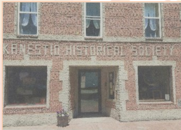
Kanestio Historical Society (front entrance)