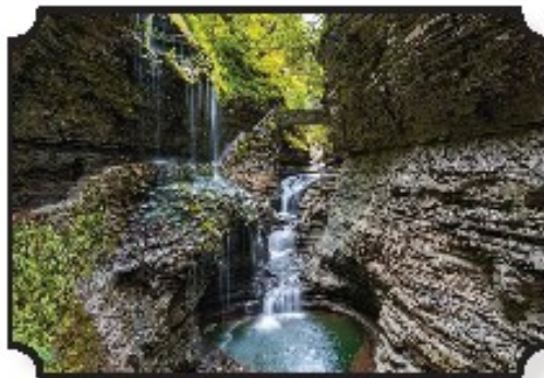
Watkins Glen State Park - Watkins Glen, NY