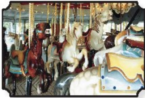
Ross Park Carousel - Binghamton, NY