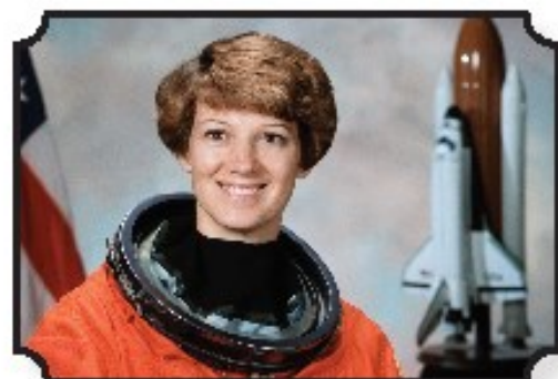
Eileen Collins - Astronaut Elmira Native