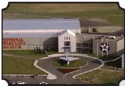
Wings of Eagles Discovery Center - Big Flats, NY