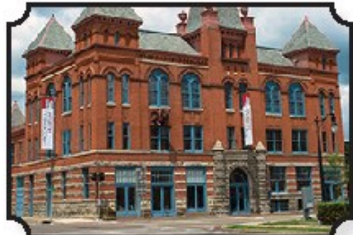
Rockwell Museum - Corning, NY