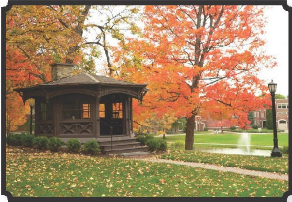
Mark Twain's Study at Elmira College