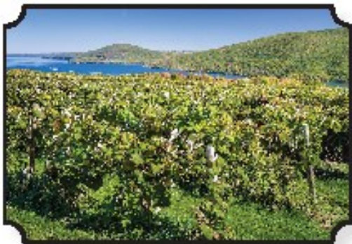
Finger Lakes Wineries