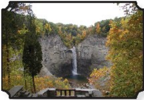
Taughannock Falls - Trumansburg, NY