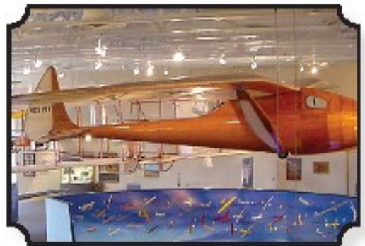
National Soaring Museum - Big Flats, NY