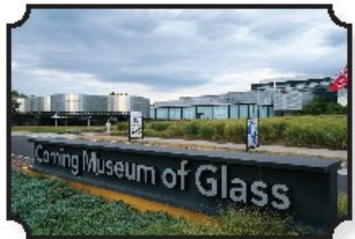
Corning Museum of Glass - Corning, NY