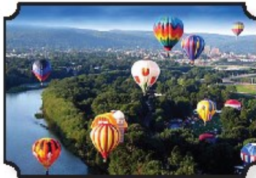
Spiedie Fest & Balloon Rally - Binghamton, NY