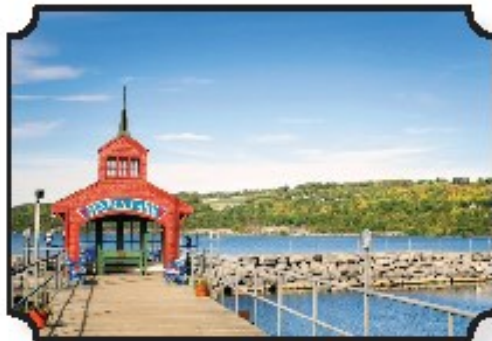
Seneca Lake - Watkins Glen, NY