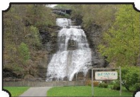
She-Qua-Ga Falls - Montour Falls, NY