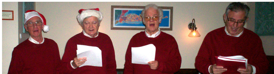
EERTA Holiday singers