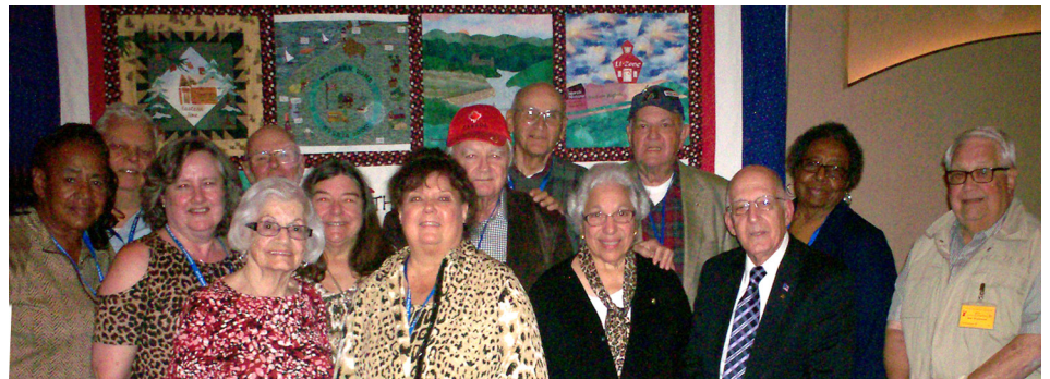
Our 2017 Convention Delegates