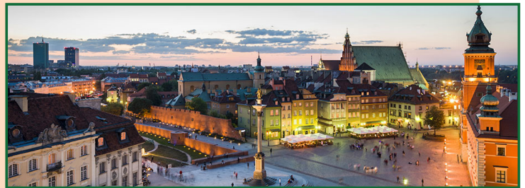
Magnificent Cities of Central & Eastern Europe