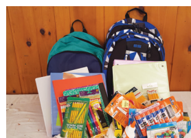
At the August meeting, C-F-E Unit members donated school supplies and $167 to the Clifton-Fine PTO for their "Back to School Backpack Program".

Physical Therapy, will speak about chronic pain causes and management. All members are also welcome at the next executive board meeting on October 17 th