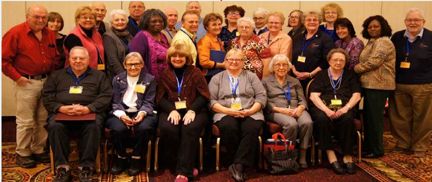
Pictured above are cheerful Central Zone delegates from Cayuga, Chenango, Herkimer, Madison, Oneida, Onondaga and Oswego Counties.

turn home with renewed enthusiasm and fresh ideas for reaching the goals of NYSRTA. Especially rewarding is the opportunity to meet delegates serving for the first time. Let's continue to encourage the participation of new retirees in positions of leadership.