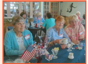
EERTA members at Flag Day luncheon in Mattituck