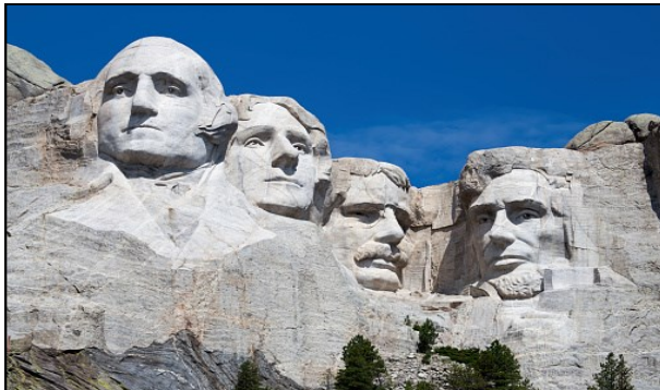
Spotlight on South Dakota featuring Mt. Rushmore and The Badlands September 08 — September 14, 2023