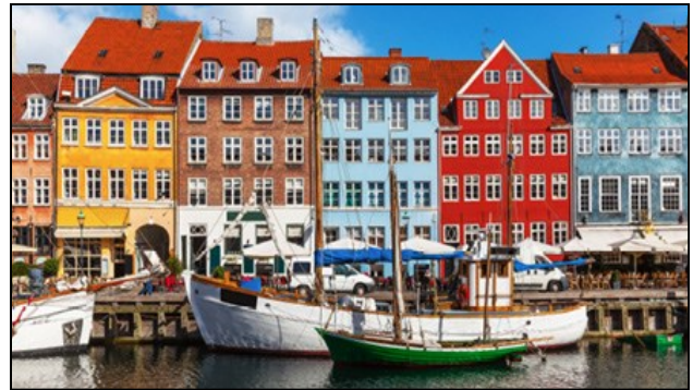
Spectacular Scandinavia May 18 — May 31, 2023