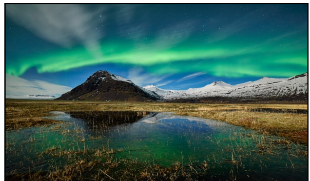
Iceland's Northern Lights November 3 — November 9, 2023