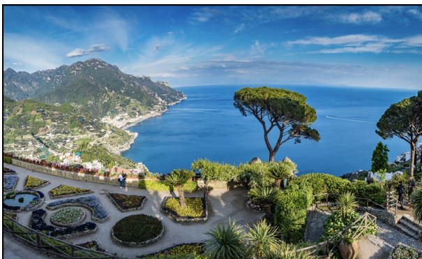
Italy: Amalfi Coast to Puglia June 22 — July 05, 2023